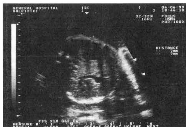
Figure 1. — A representative scan showing measurement of the fetal abdominal subcutaneous tissue thickness with a real-time ultrasound device.

on ultrasound. The FASTT was measured as previously described [6] in the anterior third of the abdomen, at the same transverse plane where the abdominal circumference (AC) is routinely measured. The calipers were placed at the outer and inner edge of the echogenic subcutaneous tissue line. In Figure 1 a representative picture of FASTT measurement is presented. Ultrasound examination was preceded by typical history and clinical evaluation, including assessment of Bishop Score and intrapartum CTG. All women were delivered by healthcare providers blinded to the findings of the ultrasound examination at 38 \pm 1 weeks. Women were followed-up in respect to the following parameters: mode of delivery (normal, operative vaginal or cesarean delivery), confirmation of fetal presentation and birth weight (BW). There were no neonates with congenital malformations or genetic disorders.