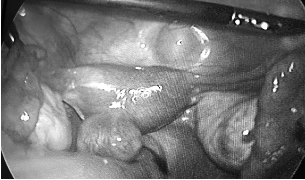
Figure 2. — Laparoscopic view of leiomyoma.