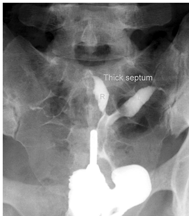
Figure 1. — Thick septum on hysterosalpingography.

dinal vaginal septum and hysteroscopic excision of a uterine septum was performed in the first operation. The uterus was noted as normal during the laparoscopic examination. A transvaginal ultrasound examination demonstrated a subserosal leiomyoma 3×3 cm in diameter on the posterior of the uterine septum. The hysterosalpingography revealed insufficiently excised thick uterine septum (Figure 1). The uterus was normal in laparoscopy except of for the subserosal 3×3-cm pedunculated leiomyoma on the posterior (Figure 2). A laparoscopic myomectomy was performed.