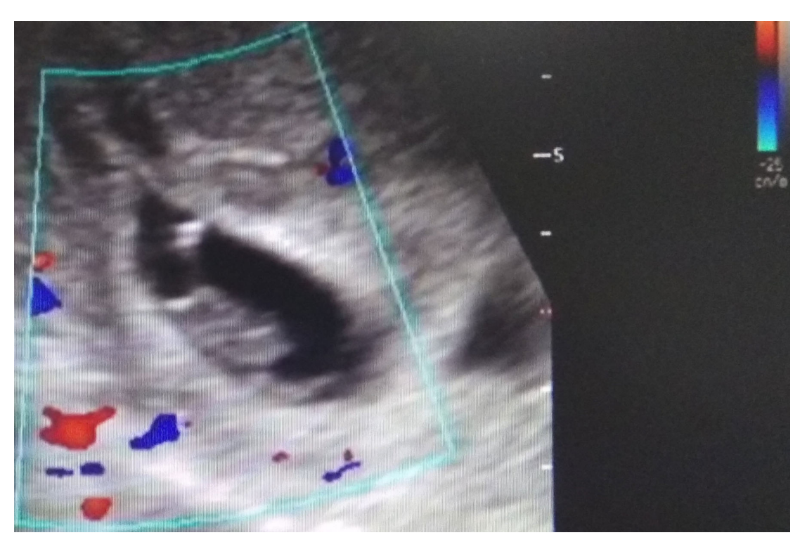
Figure 2. — A patient from the intervention group after the operation. Ultrasonic images demonstrating ectopic pregnancies. After the operation, the fetal heartbeats disappeared and the surrounding flow dropped, which was checked by ultrasound.

Elective reduction was applied for patient who chose to continue the intrauterine embryo(s)/fetus(es) and terminate the ectopic embryo(s)/fetus(es). Due to the (bleeding) risks for CSP, this procedure should be performed as soon as possible after the treatment choice is made by the patient. Our cases had different gestational weeks when they saw a doctor and made treatment choices. Therefore, the gestational ages for intervention were from 7 to 16 weeks. Specifically, potassium chloride (KCl) was injected locally into the ectopic embryo/fetus, which had small impact on the intrauterine embryo(s)/fetus(es). Follow-up consisted of ultrasound examinations and routine obstetric examinations. Weekly serum levels of \beta -hCG were not assessed owing to the live intrauterine embryo(s)/fetus(es).