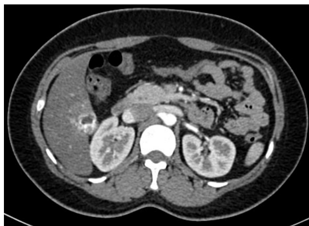
Fig. 2. CT scan revealing a solid and cystic abnormal mass in the right lobe of the liver, and during the arterial phase, the enhancement of peripheral solid components of the lesion dramatically increased.