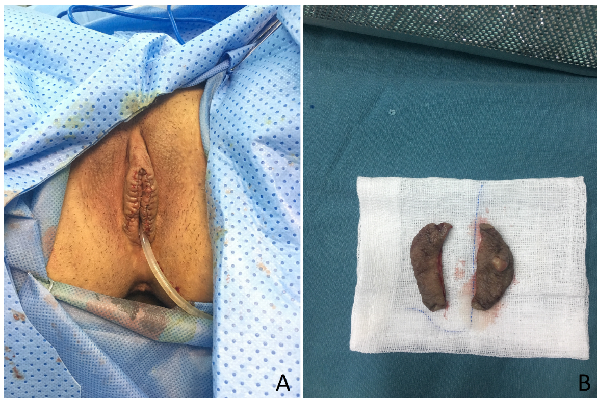
Fig. 3. Edge resections of both hypertrophic sides of labia minora. The immediate postoperative view shows the symmetry of the remaining labial tissue (A) and the excised tissue from labia minora (B).