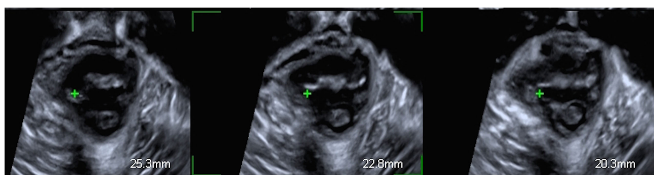
Fig. 3. Complete avulsion was diagnosed when there was abnormal insertion of the LAM in 3 central slices.

abdominal probe (Toshiba Medical Systems Corp., Tokyo, Japan) was used.