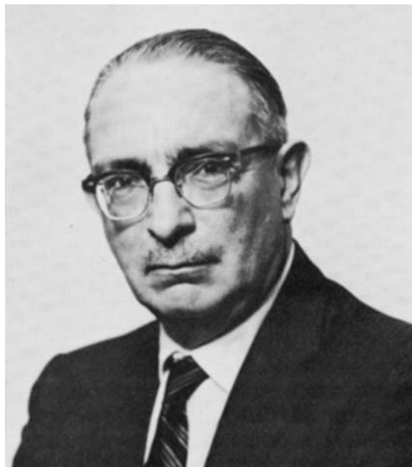
Figure 4. Wilhelm C. Hueper (1894-1978).

Although Rehn's conclusion that aniline and fuchsine are the cause of urinary bladder tumors occurrences is now out of date (intermediate substances in the fuchsine production process are carcinogenic to the urinary bladder) and we know today that some toxic symptoms he described are caused by methemoglobin (induced by exposure to aromatic amines, e.g. aniline) that in no way detracts from his pioneering achievement in this field. It includes the first description of a chemical substance that was shown to have a specifically organotropic carcinogenic effect in the urinary bladder after dermal and/or inhalative application (17). In this way he was the first to discover a cancer disease in an organ within the urogenital tract that is caused by external chemical noxae.