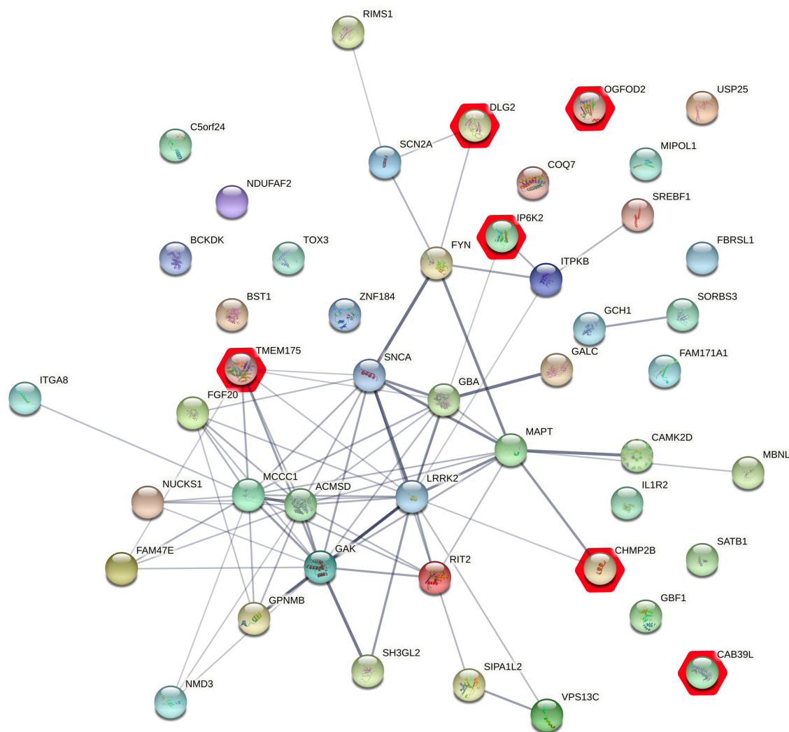
Fig. 2. Molecular interactions of PD related genes involved in this study. A total 42 protein coding genes were input into the STRING analysis. The red color highlighted are the genes related to rapid motor progression. Black lines represent protein-protein interactions, and thicker lines represent stronger links.

variants ( LINC00693 rs6808178, CHMP2B rs115185635, IP6K2 rs12497850, TMEM175 rs34311866, OGFD2 rs11060180, CAB39L rs9568188, and DLG2 rs3793947 were associated with rapid motor deterioration in PD (Table 3), and only LINC00693 rs6808178 passed multiple testing correction. Long non-coding RNA (lncRNA) has been shown function in regulating gene expression and cellular homeostasis [39]. Alterations in lncRNAs expression levels have been shown in brain tissues affected by PD compared to controls [40, 41]. Unfortunately, previous studies did not examine LINC00693 . A recent study using machine learning model found that rs6808178 was one of two key variants among 90 SNPs for developing PD using the same PPMI cohort [42], which suggest LINC00693 is important in the onset and progression of PD.