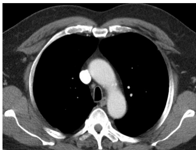
Fig. 2. A representative image of contrast enhanced CT scan showing patent IMAs bilaterally along the sternum.

Out of the patients that had post-radiation CT scans where the coronaries were assessed, 28 out of 66 (42.4%) had coronary artery calcifications (CAC) present (Fig. 2). Of those 28 patients with CAC visualized on follow up CT scans, only 9 patients had pre-radiation CT scans available for comparison. Out of these 9 patients, only 2 (22.2%) patients had no coronary calcification on pre-radiation imaging and therefore they were considered as new calcifications.