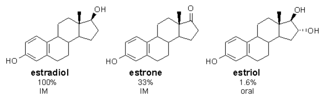
Figure 1. Natural estrogens. Although estradiol is the most active with 100% activity, the advantage of estriol is that it can be taken orally